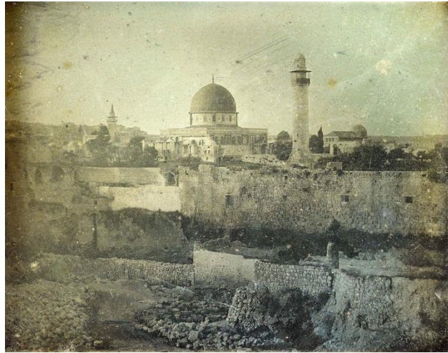
Jerusalem 1844 (first photograph of the city) >>>

I know this oversimplifies some modern-political dynamics, but I wish to speak to justifications that are often given for our Each of our traditions have laid particular claims territory of ancient Israel, and have sacrificed for it. As Christians, the territory on which walked and taught and died, is the holiest ground For Jewish folks, Jerusalem is the site of the