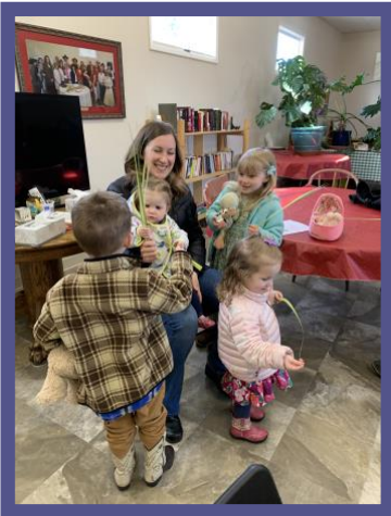
Preparing the palms on Palm Sunday