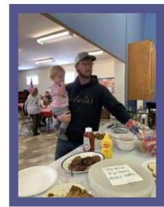
Photos from last October's cleaning and BBQ